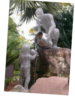
4-way test (2003) Victor Tan