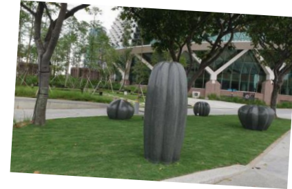
Seeds (1995) Han Sai Por